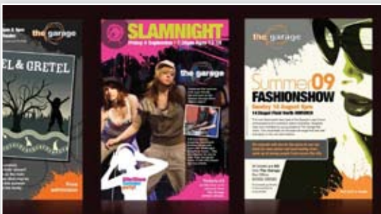
Contemporary and stylish literature designs to engage the creative community.

ETT Brand Delivery have worked with The Garage to deliver contemporary literature ranges designed to engage the young creative community, branding exercises to take the brand across many types of media application as well designing and building an innovative website via sister company Affinity New Media.