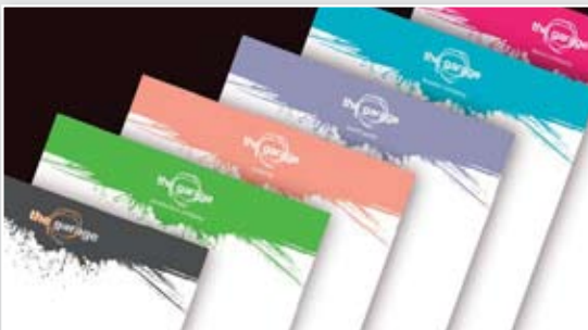
Branding extended across a full stationery range.