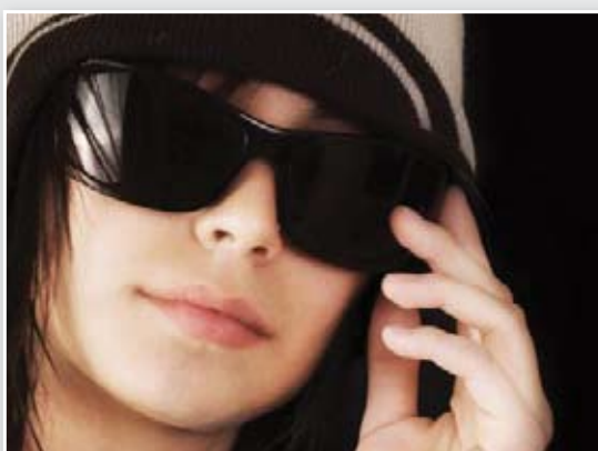
Possibly one of our coolest clients to work with!