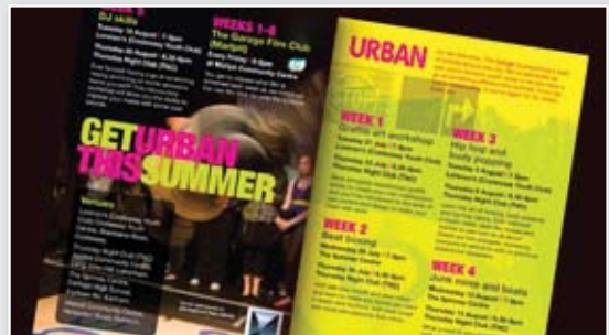
Publishing regular programmes of events involved close client liaison with strong agency account management.