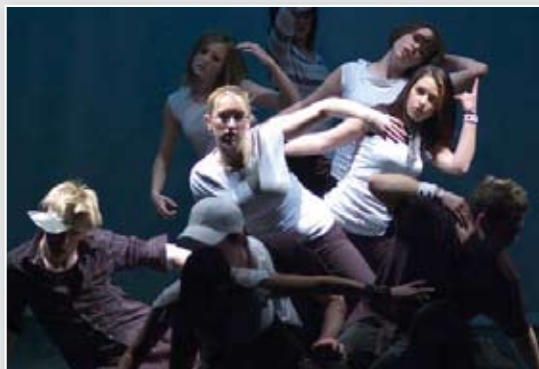
...through to the theatre are all part of the Garage.