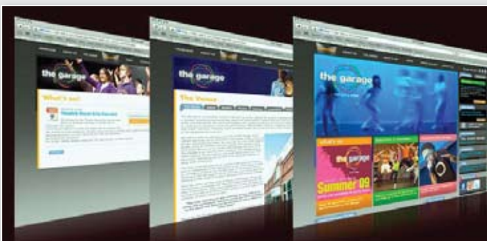
A dynamic on-brand web presence was produced by sister company Affinity New Media.