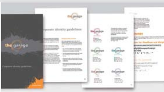
ETT Brand Delivery produced a clear set of brand guidelines that the client could use both internally and as a guide to external third party suppliers to maintain brand integrity.