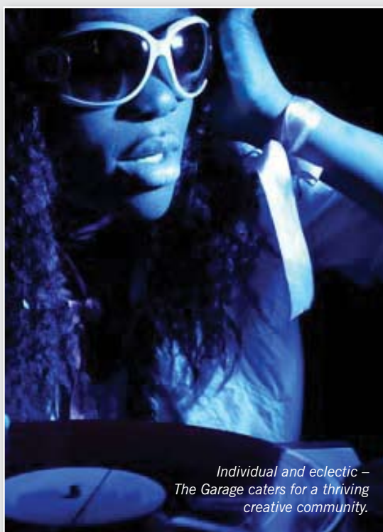
Individual and eclectic – The Garage caters for a thriving creative community.