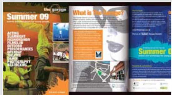
The client needed design that matched the aspirations of its main user groups.