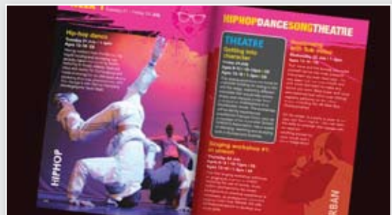
Innovative and contemporary design reflects the dynamic content matter.